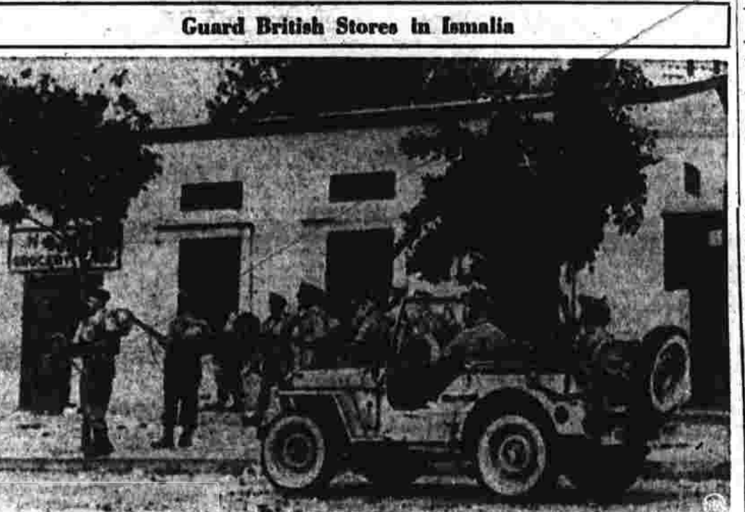
Guard British Stores in Ismailia British troops, with rifles at the ready, guard military stores in the Egyptian city of Ismailia. British forces occupied that city and Port Said because of a "shortage" of local police, and guarded the Suez Canal against anti-British rioters. (NYA Radio-Telephoto)

Fayid, Egypt, Oct. 18.—(AP)—British troops firmly sealed off the Suez Canal zone from the rest of Egypt today. Every port of entry into the vital area was under heavy guard and Egyptian civilians and soldiers alike were subject to British control. Caigo, Egypt, Oct. 18.—(AP)—Backed by growing sea, land and air forces, Britain tightened her hold on the strife-ridden Suez Canal area today and moved against Egyptian officials in the vast Sudan area south of Egypt. The British naval gun trained on the Suez, authoritative sources here said the Sudan's British Governor General, Sir Robert G. Howe, had ordered two top Egyptian officials not to return to their posts there for the time being. (Continued on Page Two)